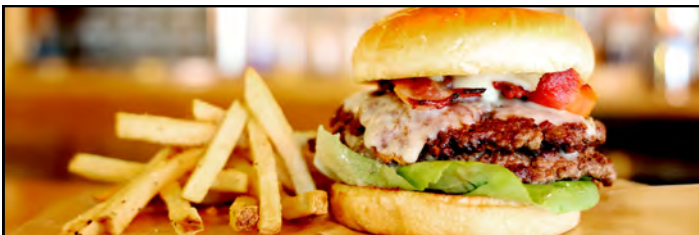
Trail Town Brewing offers seven unique smash burgers