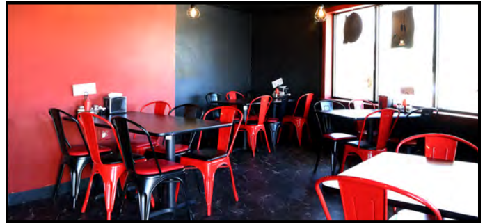
Bentino's new dine-in seating area

Bentino's Pizza first opened its doors to the village in 2006, a humble tenant of 107 1/2 Xenia Avenue hoping to provide residents with a local food option that offered delivery. Nearly 20 years later, proprietors Carl and Kim Lea are reaping the benefits of hard work and dedication.